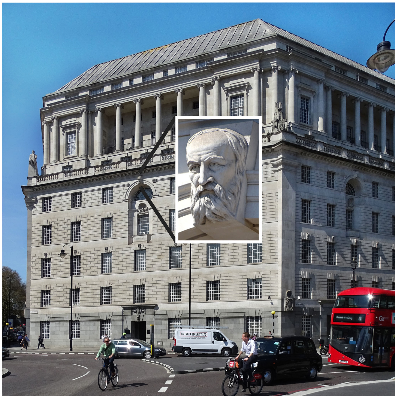
Fig. 3 Dmitri I. Mendeleev on the façade of the former ICI headquarters, 9 Millbank, SW1, London

Mendeleev's missing Nobel Prize is one of the most conspicuous omissions in the roster of Nobel laureates. Given Mendeleev's milestone contribution to science, his subsequent fame, and the fact that his Periodic Table of the Elements hangs in classrooms all over the world wherever chemistry is taught, his name is above all worldly recognitions. It is the institution of the Nobel Prize that suffers from his absence from among its awardees. As the Academie Française wrote